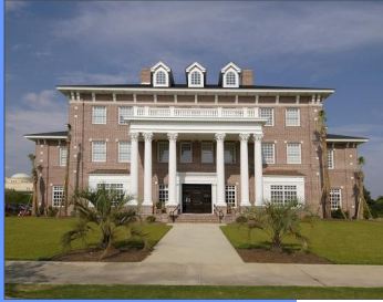
Chi Psi House at the University of South Carolina